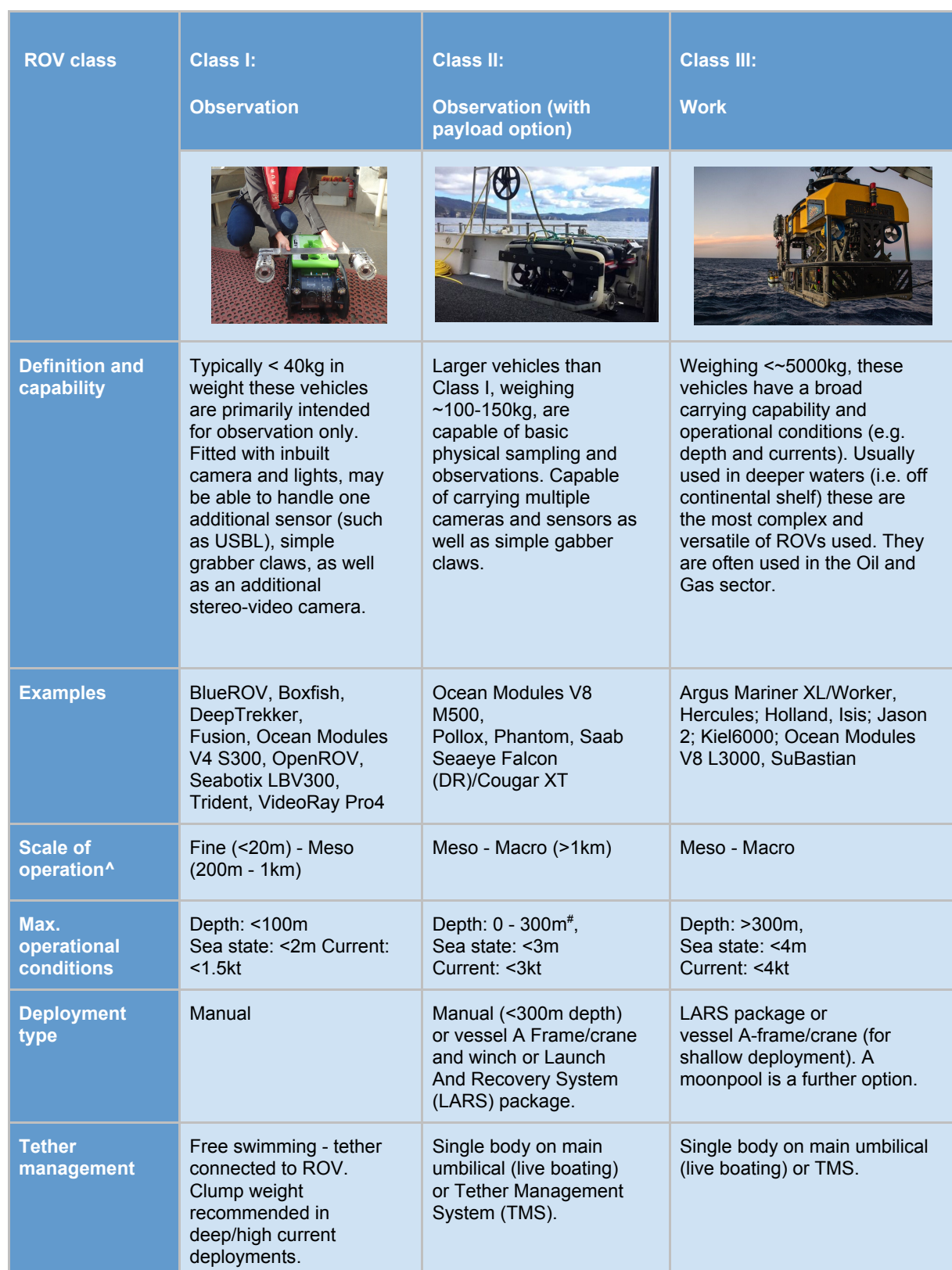
Table 10.2: Summary of ROV classes and considerations associated with each when used for monitoring Australia's marine estate (table modified from JNCC, 2018).